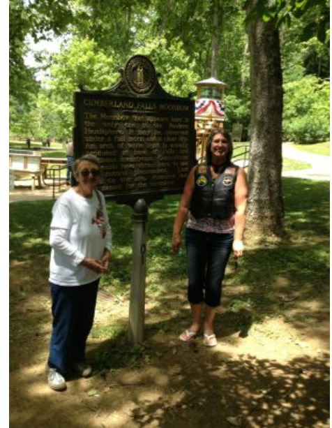
Here are some of our ladies during the fun ride to Cumberland Falls.