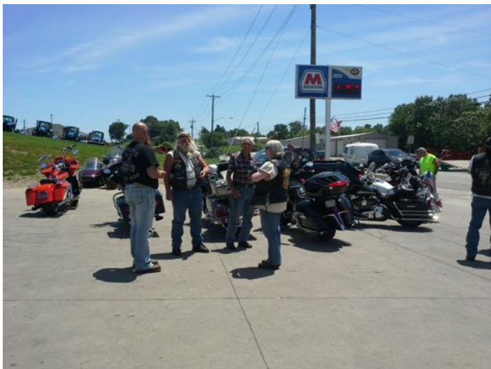
Here is one of the stops along the ride to support Herbie's church.