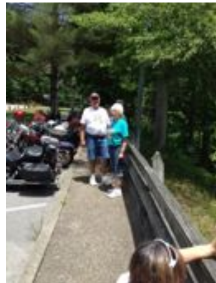
Another Cumberland falls picture of our rescue truck driver and his sidekick.